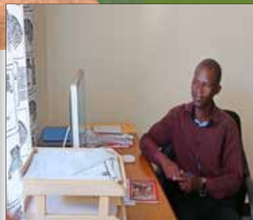
DEPUTY'S MESSAGE PG 4