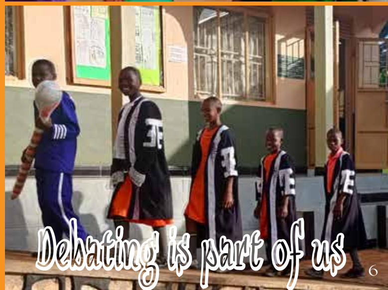
Debating is part of us