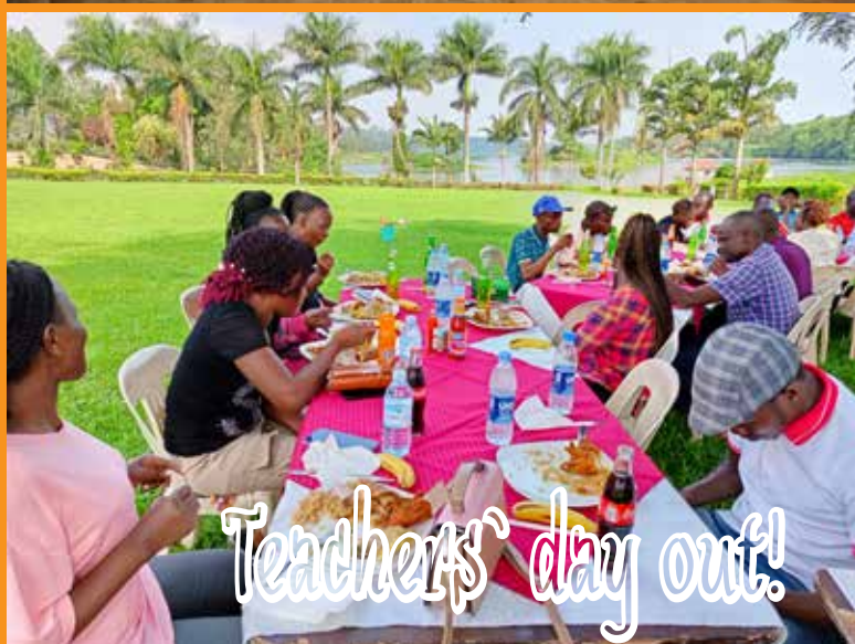
Teachers' day out!