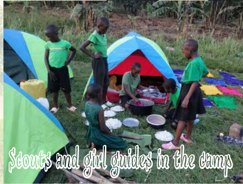
Scouts and girl guides in the camp