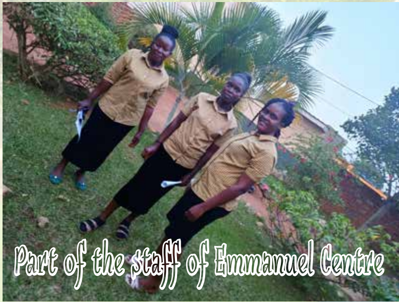
Part of the staff of Emmanuel Centre