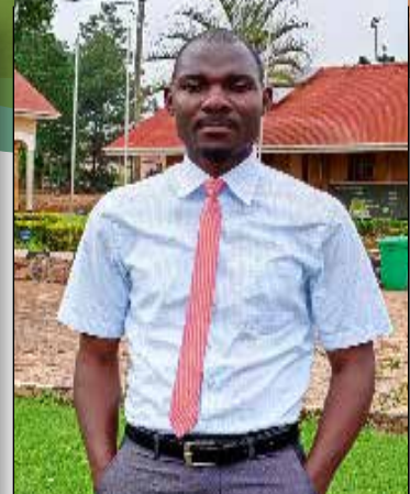
EDITOR'S MESSAGE PG 8