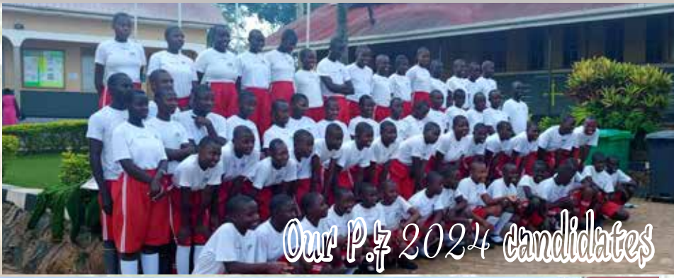
Our P.7 2024 candidates