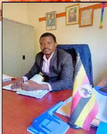
HEAD TEACHER'S MESSAGE PG 3