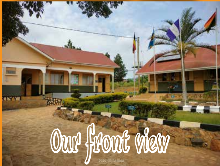
Our front view