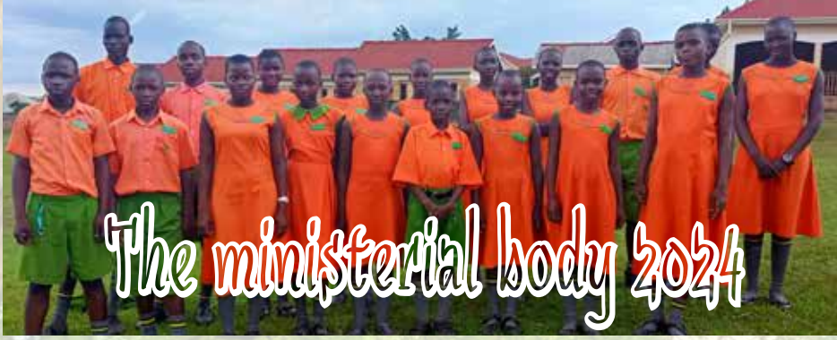
The ministerial body 2024