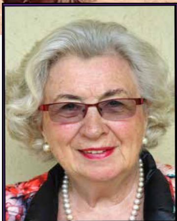
DIRECTOR'S MESSAGE PG 2