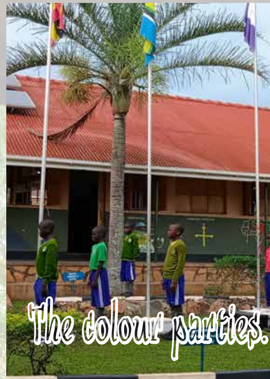
The colour parties.