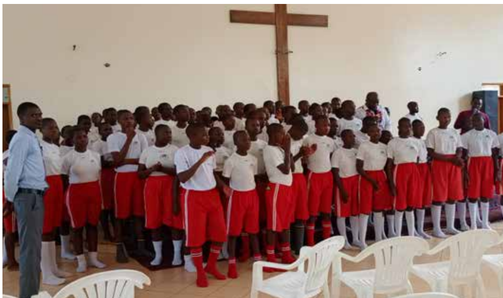
The candidates of 2024 receiving blessings for exams on 25 th of October