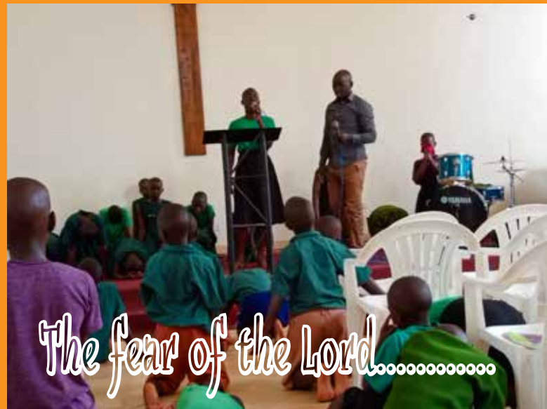
The fear of the Lord.....